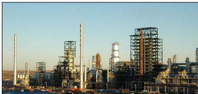
DCL Plant, Erdos, Inner Mongolia, China

Headwaters has developed a direct coal liquefaction (DCL) process used for converting coal into clean transportation fuels. Headwaters CTL, LLC is licensing this technology internationally. The first commercial plant started up December 30, 2008 in China. This is a 20,000 barrel per day plant owned by the Shenhua Group, the largest coal mining company in the world. The installed capital cost of this plant is $1.5 billion (2007 dollars). The estimated break even cost is $35 – 40 per barrel selling price (Q. Sun, US-China Energy Center, WVU, Unconventional Fuel Forum 2008, presentation).